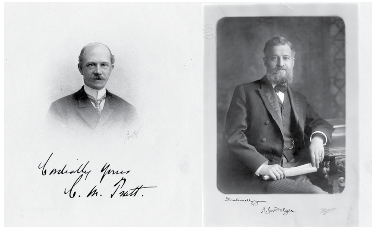
Signed photo of Charles M. Pratt of Standard Oil Co. Mrs. Charles M. Pratt, c1885, Courtesy of Amherst College Archives and Special Collections.